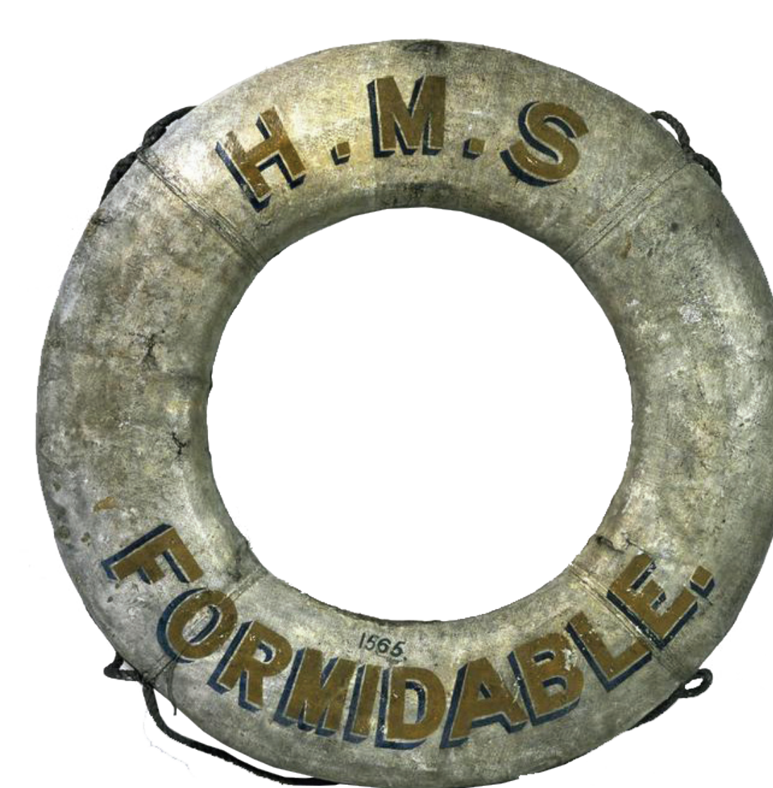
Above: HMS Formidable . Originally published in the Illustrated London News in January 1915.